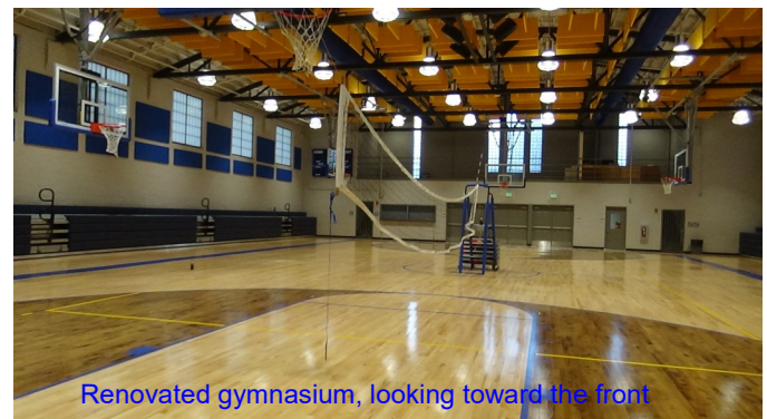
Renovated gymnasium, looking toward the front