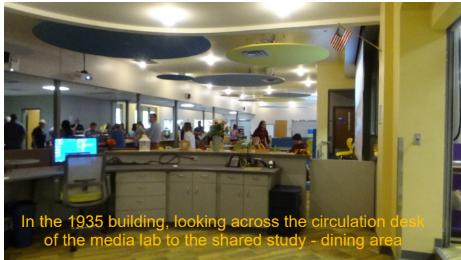
In the 1935 building, looking across the circulation desk of the media lab to the shared study - dining area