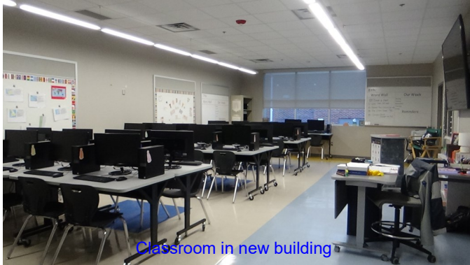
Classroom in new building

The new Granite Falls Middle School cost about $25 million with the N. C. Education Lottery providing $15 million. When the project started, the school had approximately 45,000 square feet of space. Roughly half was demolished, including the office space built between the two buildings, the lower building (aka "junior high"), and the old shop. There is now 54,000 square feet of new construction, which features environmentally friendly LED lighting and super insulated concrete forms (R-45). Reusing the 1935 building and the 1948 gymnasium has been deemed more energy efficient than making new brick and mortar. The 1935 building now houses the "technitorium," which consists of the kitchen, shared dining-study area, media lab, guidance offices, and classrooms for Career and Technical Education. Renovations in the gym include an elevator, remodeled locker rooms, and new flooring.