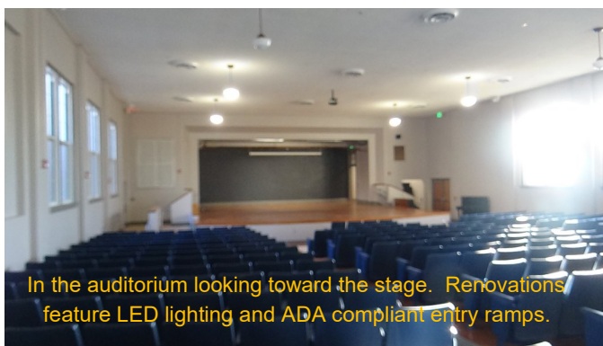
In the auditorium looking toward the stage. Renovations feature LED lighting and ADA compliant entry ramps.