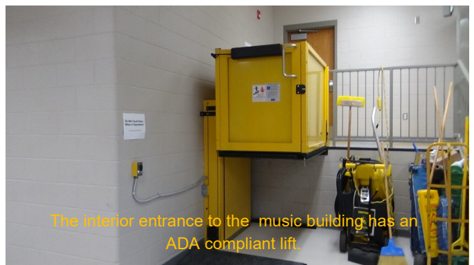
The interior entrance to the music building has an ADA compliant lift