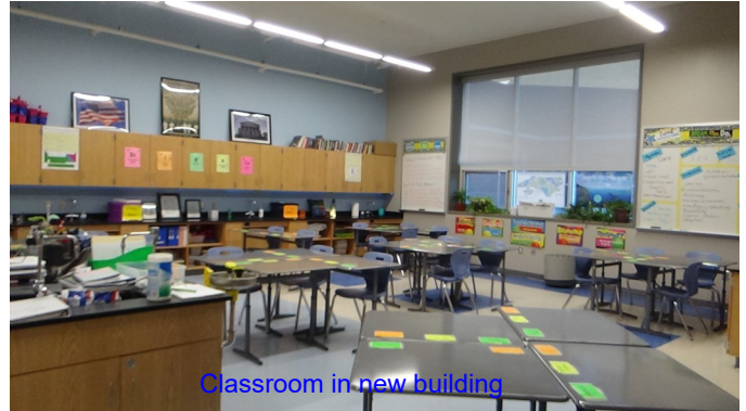
Classroom in new building