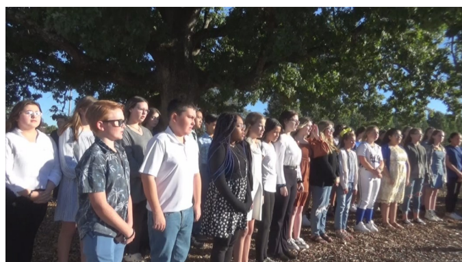
The above photo features most of the GFMS Choir who sang the National Anthem. A few are off-camera.