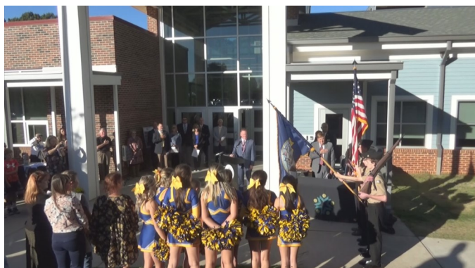
The above photo shows the SCHS NJROTC posting the colors. The GFMS cheerleaders (featured in the foreground) pumped up the crowd's spirit before the ceremony began.